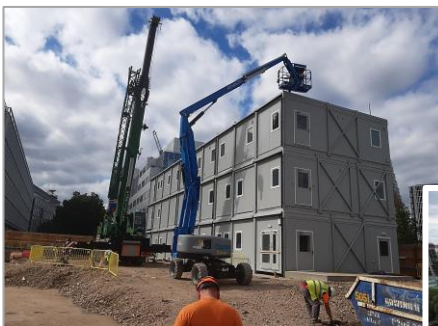
Welfare/offices being installed