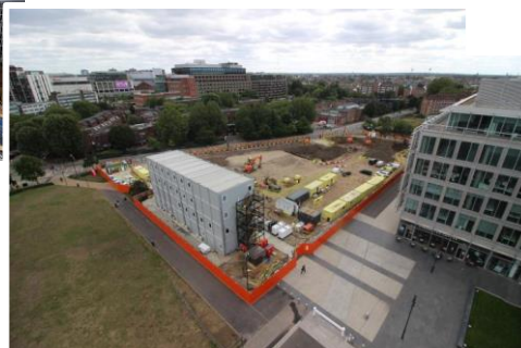
Site eye views